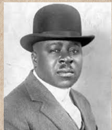
ROBERT SENGSTACKE ABBOTT (1868-1940)

American lawyer, newspaper publisher, and editor, Abbot founded the Chicago Defender weekly newspaper in 1905. It became the highest circulation of any black-owned newspaper in the country and was in print until 2019. His newspaper was an integral part in encouraging African Americans to migrate from the South for better economic opportunities.