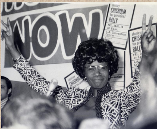
SHIRLEY CHISHOLM (1924-2005)

Shirley Chisholm was the first Black woman elected into Congress in 1968.